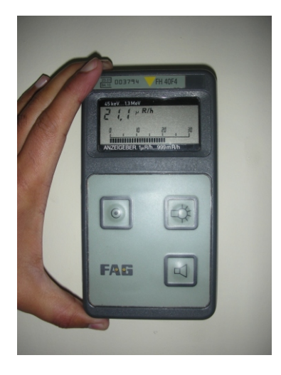
Figure 1. A view of FAG dose rate meter used during present study

during the period of April-June 2008, at a reference height of 1 meter above the ground level in the open air. The present study area, northern Rechna Doab (fig. 2), was divided into 24 28 sq. km spatial grids to evenly distribute the data collection points. It was assured that reading at every data point was a true representation of the radiation level. Ten to fifteen readings were taken at each location for this purpose and their mean value was converted to the absorbed dose rate in air [8]. The minimum, maximum, and mean value of the absorbed dose rate in air and the outdoor effective annual dose from terrestrial origin derived from these measurements are mentioned in tab. 1.