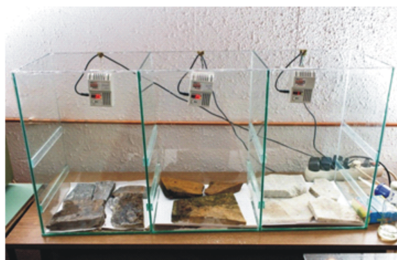
Figure 3. Chamber assembly for radon exhalation measurements

from the environment. Samples, from which radon gas emanates freely, are located at the bottom of each compartment.